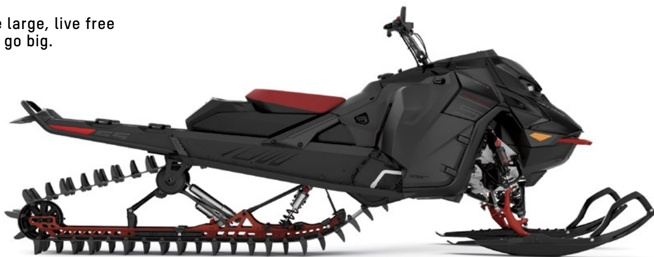
FREERIDE 165 850 E-TEC TURBO R SHOWN